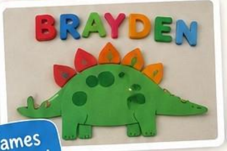
Names & dinos!