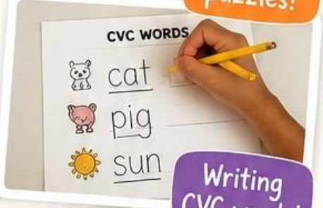
Writing CVC words!