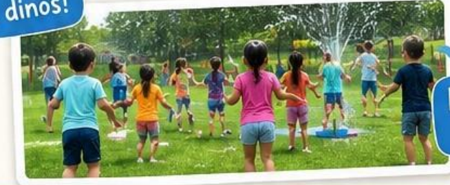
Field Day fun!